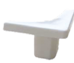
SBF 30 P