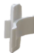
SBG 30 P