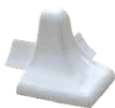
SBE 30 P