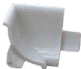
SBI 30 P